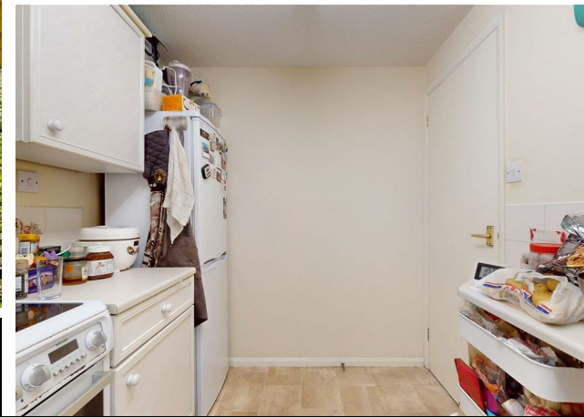
Langton Way, St. Annes Park